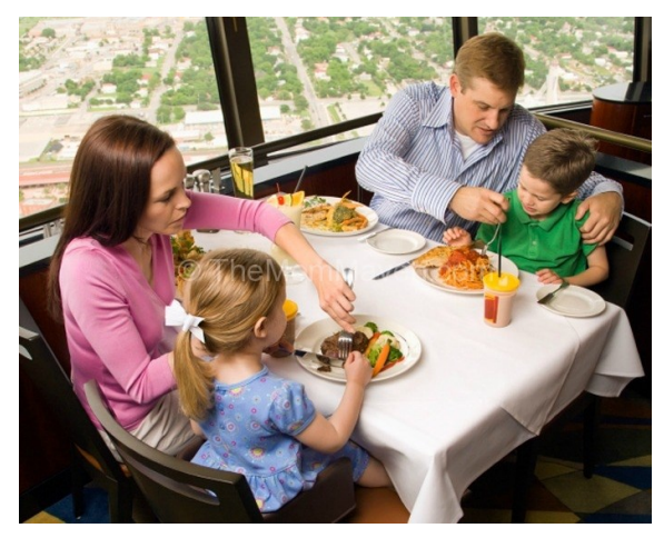
"If I could give my child three things, it would be the confidence to always know their self-worth, the strength to follow their dreams, and the ability to know how truly, deeply loved they are."