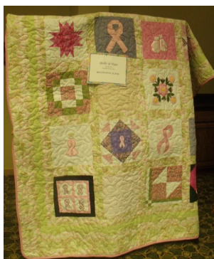
Quilts on display at the Volunteer Luncheon