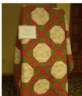
Quilts on display at the Volunteer Luncheon