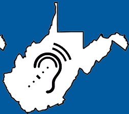
ASSISTIVE LISTENING DEVICE

In the event of a medical emergency or police proceedings, I have the right to a qualified interpreter. To find qualified interpreters through the Online Interpreter Directory, visit www.wvdhhr.org/wvcddh/pdf/Interpreter%20Directory.pdf