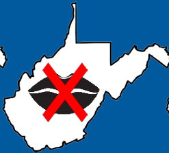
I CANNOT LIP READ