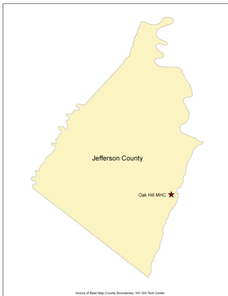
Figure 1: Oak Hill MHC, LLC Location Map

Please report any inaccuracies on either the map or inventory by calling the SWAP Program at 304-558-2981.