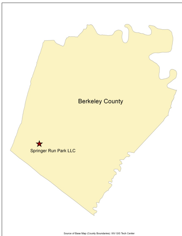
Figure 1: Springer Run Park LLC Location Map

Please report any inaccuracies on either the map or inventory by calling the SWAP Program at 304-558-2981.