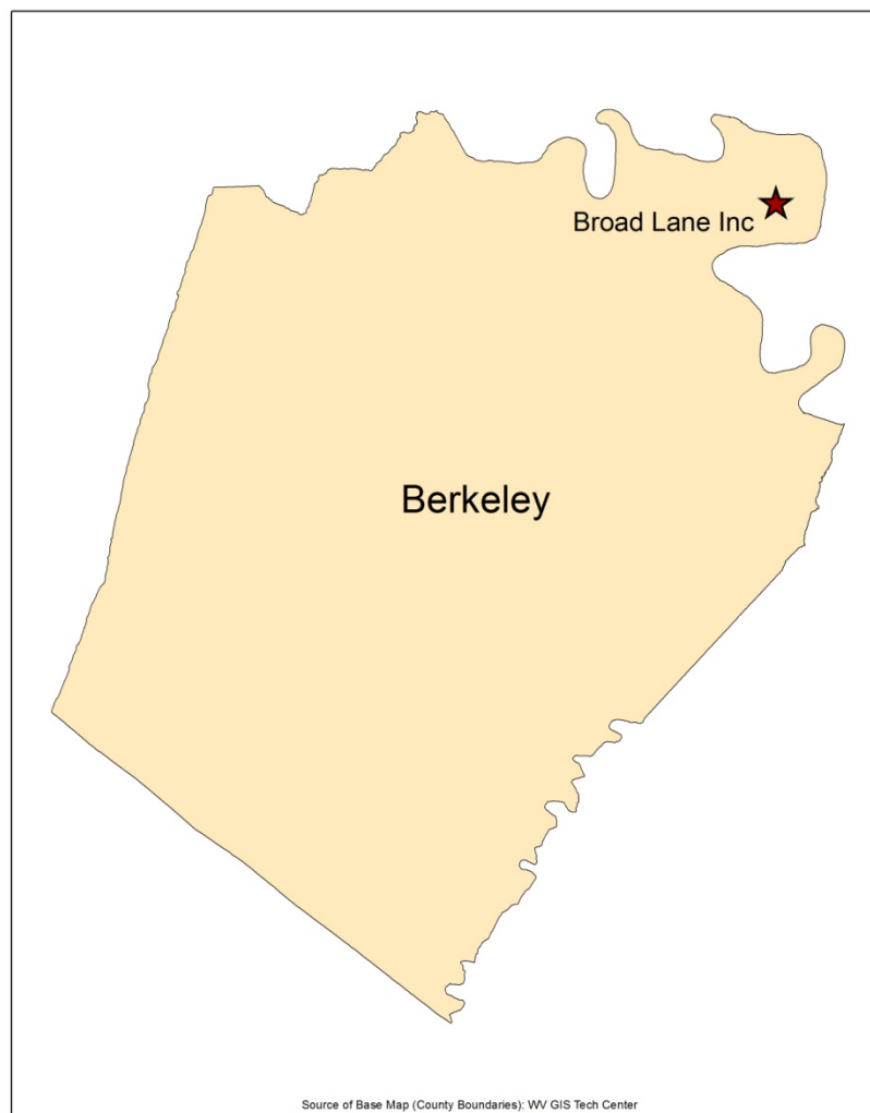
Figure 1: Broad Lane Inc Location Map

Please report any inaccuracies on either the map or inventory by calling the SWAP Program at 304-558-2981.