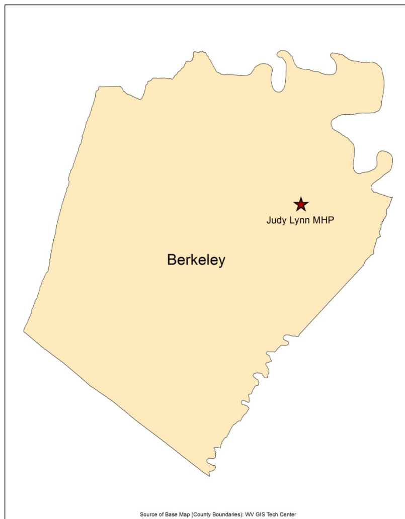
Figure 1: Judy Lynn MHP Location Map

Please report any inaccuracies on either the map or inventory by calling the SWAP Program at 304-558-2981.