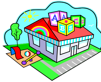
Components of Quality - A preschool age training

by the Early Childhood training Specialist with each provider enrolled in the training. Participants of this training need to make every effort to be at all scheduled training sessions and to be on time. Providers must be on the participant list in order to attend these sessions. NO walk-in or stand-by participants will be accepted and there will be no waiting lists for individual sessions.