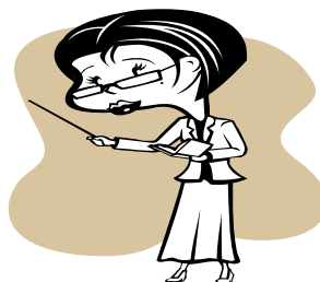
Important training information!

Family Child Care Providers must complete First Aid and CPR Training within six (6) months of registration. First Aid and CPR count toward the health and safety required hours. Two (2) hours of health or safety training plus an ad-