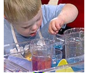
Who knew children can learn so much from "playing" in water?

For other great ideas on water play and other wonderful activity ideas, log onto www.aplaceofourown.org .