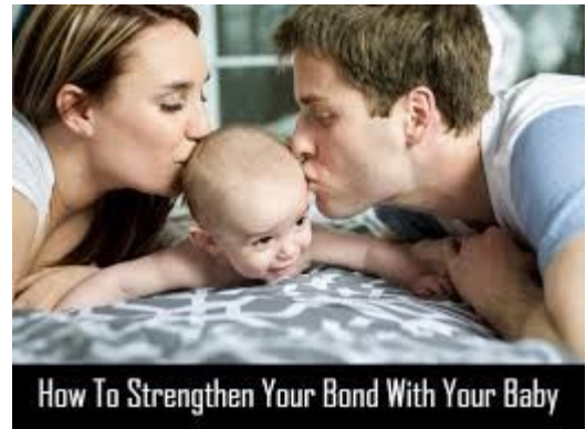
How To Strengthen Your Bond With Your Baby