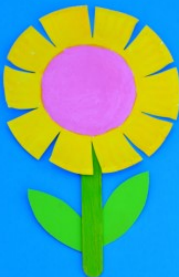
Paper Plate Flower theresourcefulmama.com

All activities require adult supervision and participation. Please be aware of small parts that could pose as a choking hazard.