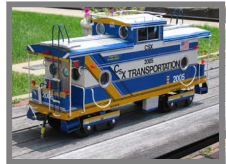
CSX Transportation Caboose that was raffled for Diagnostic and Treatment Fund

The Council received more than twice its goal in donations, with a total donation total of $2,328 going to the WV Diagnostic and Treatment Fund!