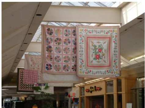
Quilts displayed at Morgantown Mall

who has not returned for follow-up that is screened will receive a $10 Wal-Mart gift card. In order to be eligible for the $10 gift card, the patient must receive a complete medical examination in accordance with WVBCCSP protocol and complete a brief survey in the doctor's office. The survey will serve as a trigger for the issuance of a gift card to be mailed directly to the patient's home address as reported on the survey.