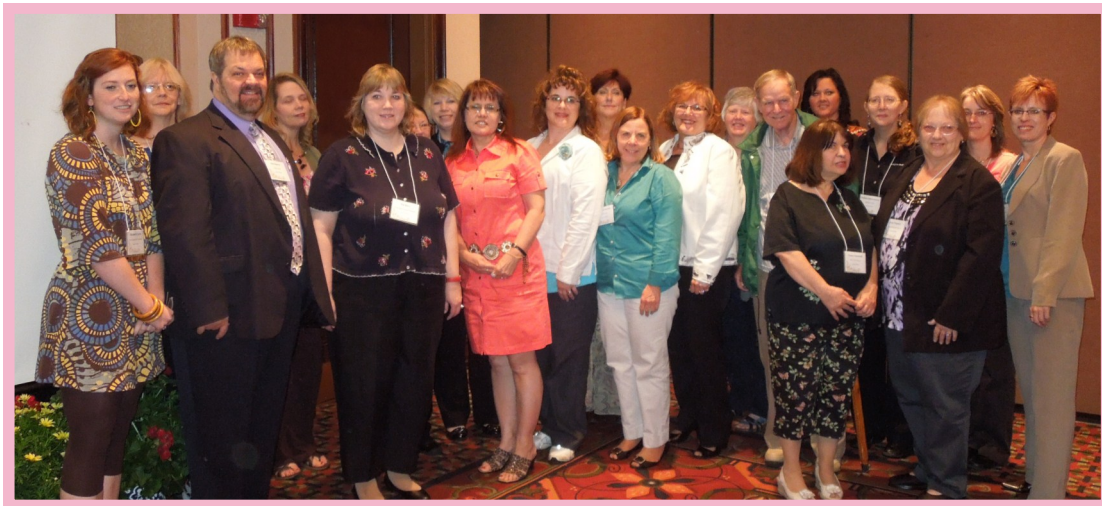
Agents of Hope Members Attending the Agents of Hope Celebration, April 26, 2012:

Incorporating the AOH event into a meeting allowed for the event to be a celebration of all MOH activities and a recognition of the AOH. Twenty-two AOH attended the event with a total of 58 people in attendance.