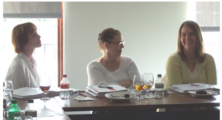
PHNPAT participants focus on speakers during PHNPAT