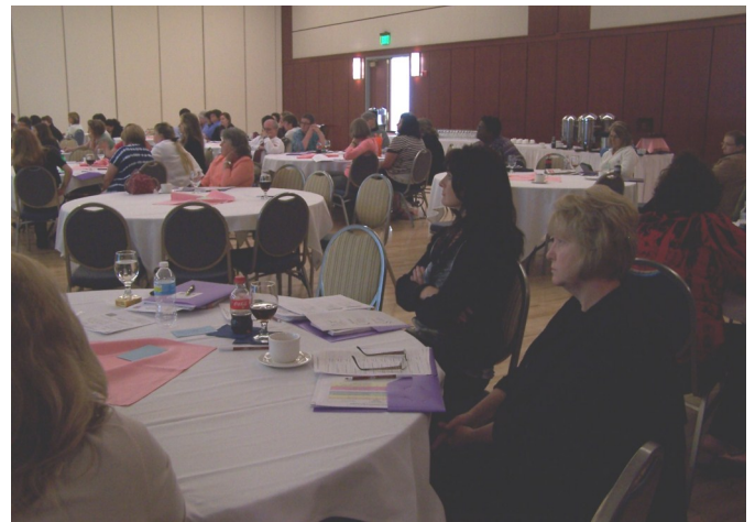
WHIPs participants listening to the afternoon speakers.