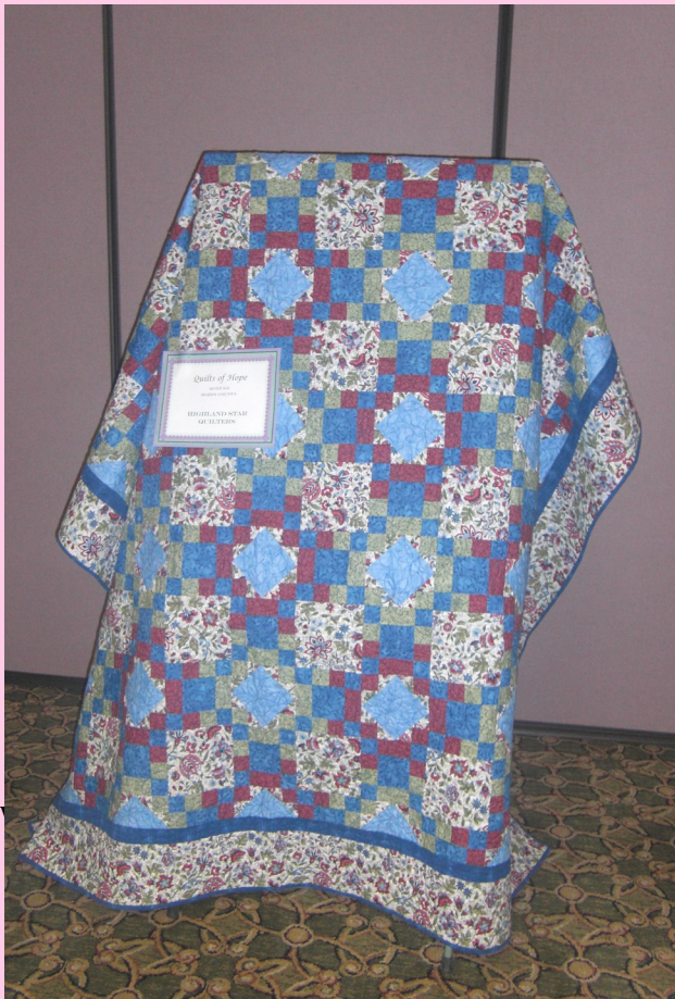
Highland Star Quilters, Hardy County