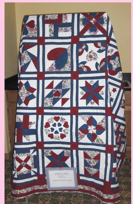
Wirt County CEOS