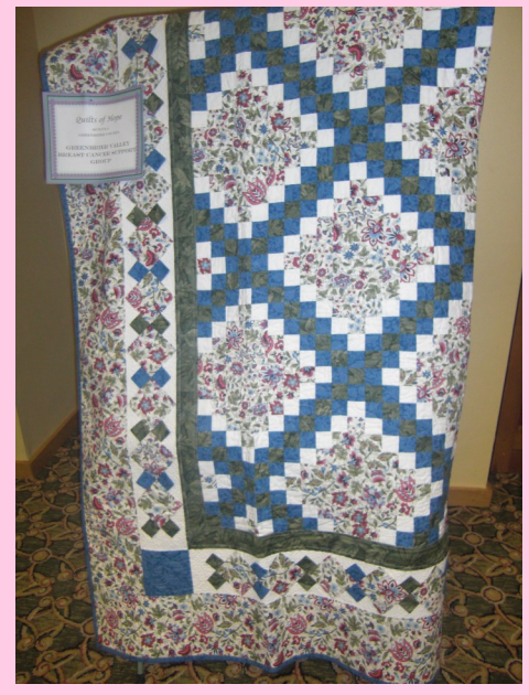
Greenbrier Valley Breast Cancer Support Group