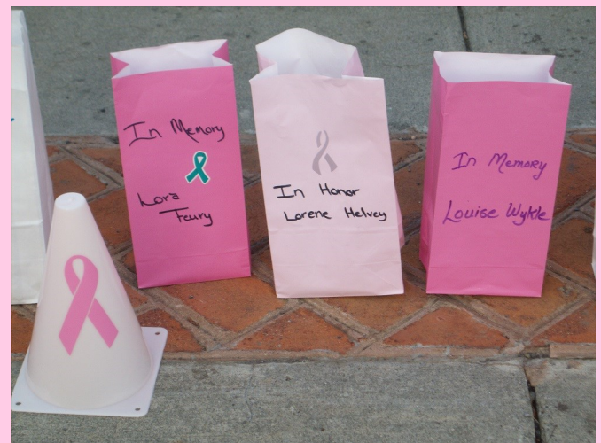
Honoring Cancer Survivors and remembering those that lost their battle with cancer at a BCAM event in Monroe County.