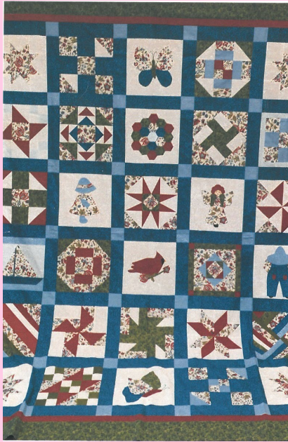
Monongalia County Extension Quilt Club