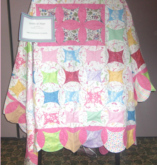
Belington Clinic, Barbour County