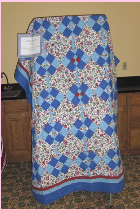
Wetzel County Cancer Coalition