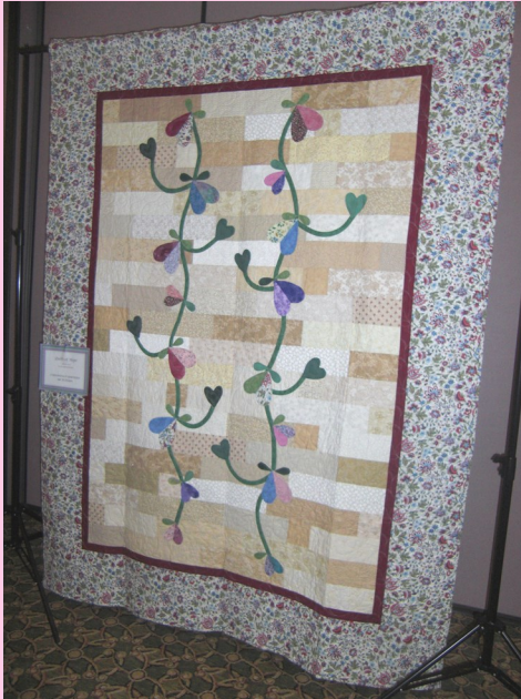
Christian Sisters Quilters, Taylor County