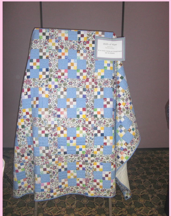
Racine CEOS and Comfort Quilters, Boone County