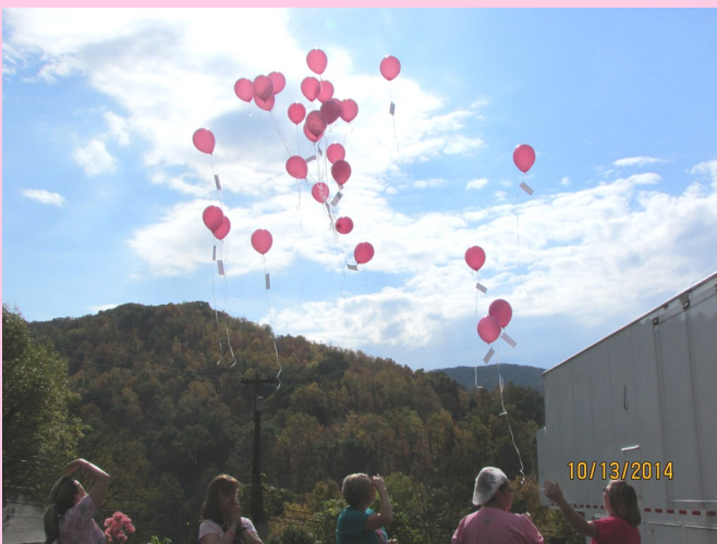
Honoring Cancer Survivors and remembering those that lost their battle with cancer at a BCAM event in Webster County.

The goal of all of these events is to increase awareness about the importance of screening for breast cancer, raise money for the D&T Fund and to honor breast cancer survivors. The WVBCCSP thanks everyone that participated in the awareness and fundraising events this year. Our partners and volunteers stepped up to the challenge once again and the Program is very thankful.