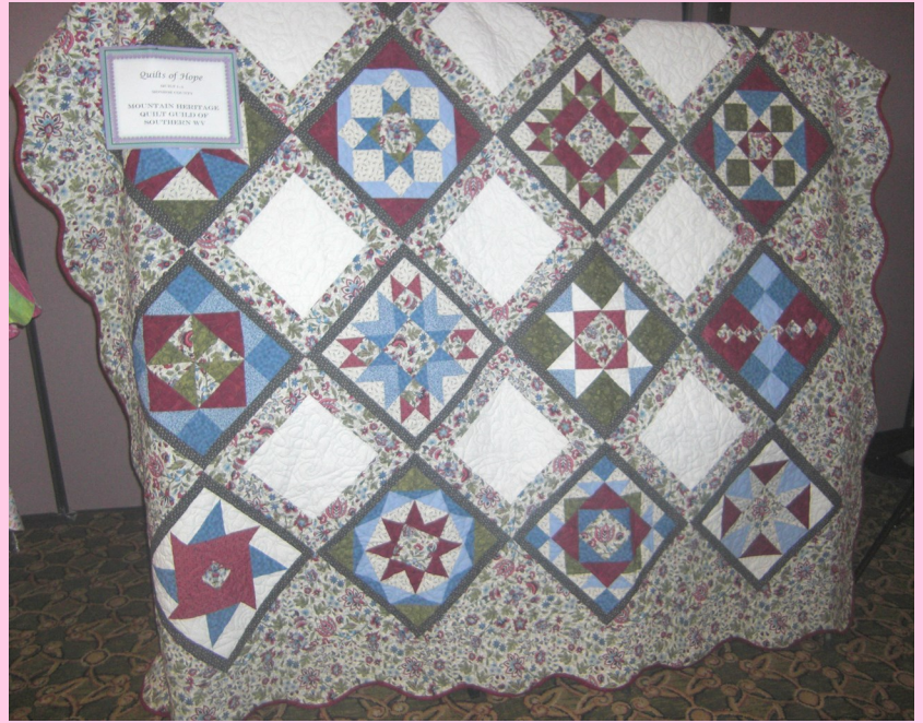
Mountain Heritage Quilters Guild of S. WV, Monroe County