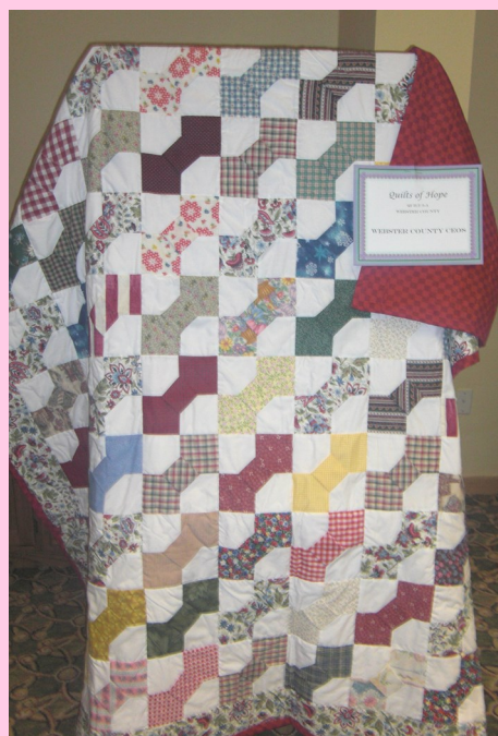
Webster County CEOS