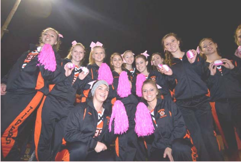
Wirt County Cheerleaders