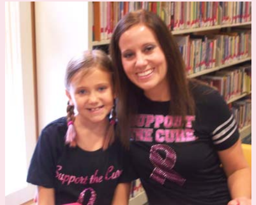
A mother and daughter at the Man Walk.

A breast cancer survivor (sitting in rocking chair), is currently undergoing treatment. Her family came from WV, Ohio, and South Carolina to support her in the Man Walk for Women. She also raised money for the D&T Fund through Facebook.