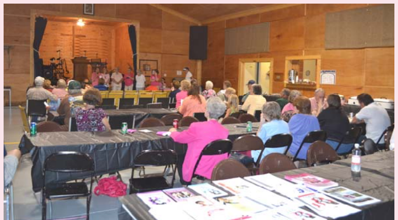
Dinner and auction in Monroe County