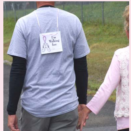
A cancer survivor and his wife at the Quinwood Walk.