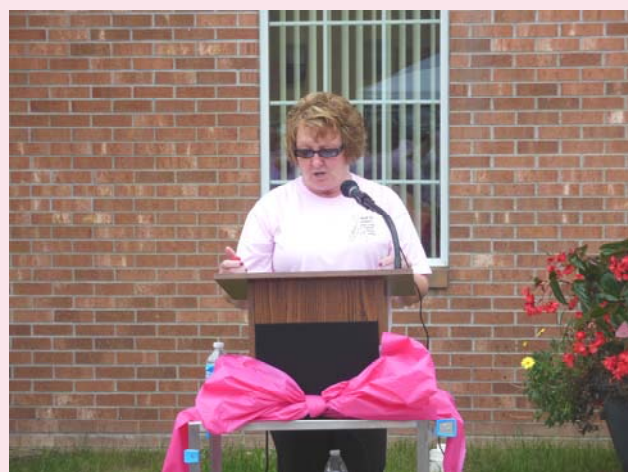
Survivor speaks at the Williamson Walk