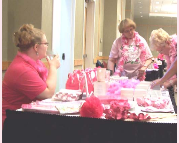
Student taking care of a Fundraising table at the Harrison County Breast Cancer Awareness Walk