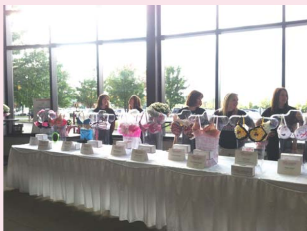
Breast Fest in Weirton