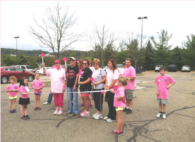
Janie's Walk, Wheeling