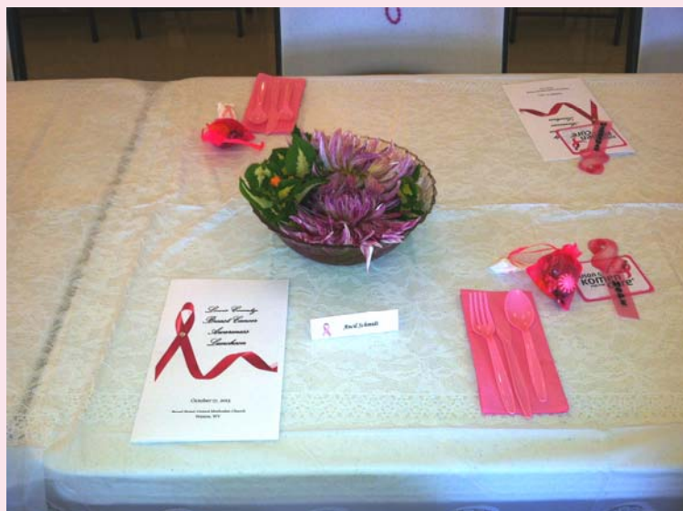
Lewis County Breast Cancer Survivor Luncheon