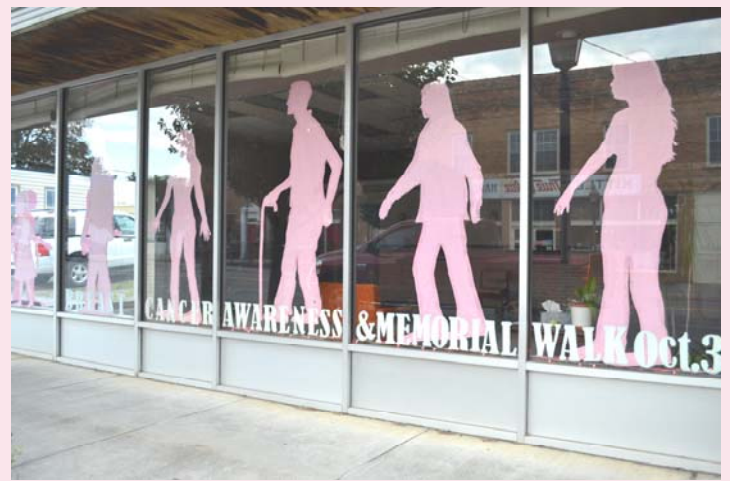
High school students in Union made life sized decals, displayed at a local auto dealership