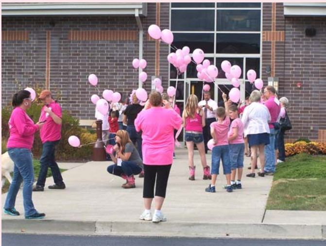
Breast Cancer Awareness Walk in Harrison County