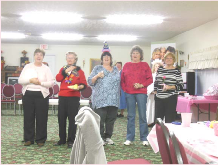
Kellogg Independent Holiness Church of God in Wayne