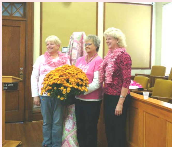
Pleasants County Breast Cancer Survivor Luncheon