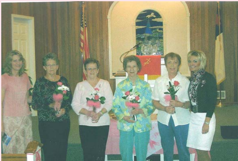
Bethel Church of the Brethren in Petersburg