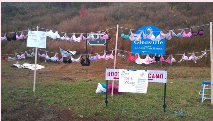
Bras For the Cure in Gilmer County