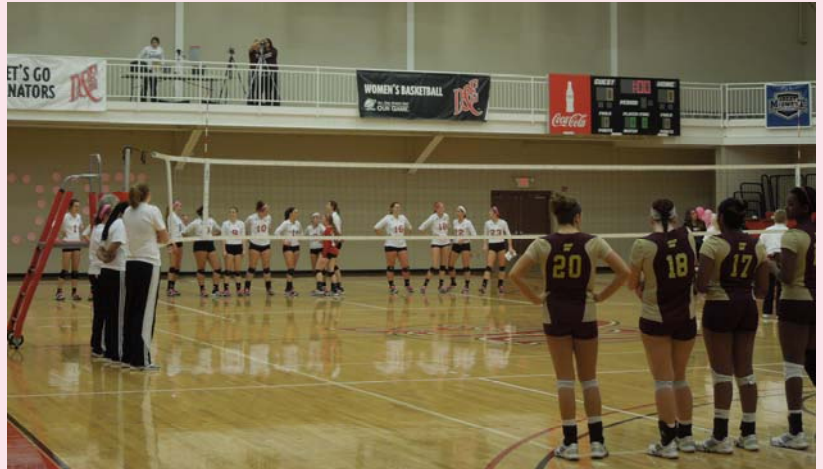
Davis & Elkins women's volleyball team hosted a 'Be Bold Think Pink' night at an October game.