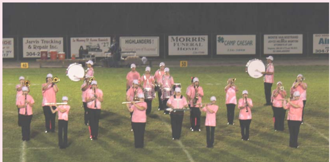
Camden-on-Gauley High School Band