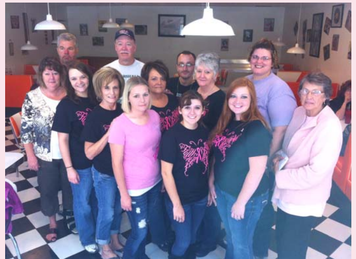
Pancake Breakfast at Sterling Drive Inn , Welch