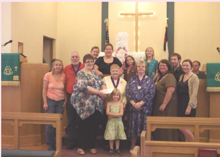
Pray for a Cure service at First United Methodist Church in Webster Springs