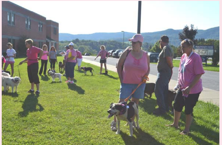
Dog Walk in Union