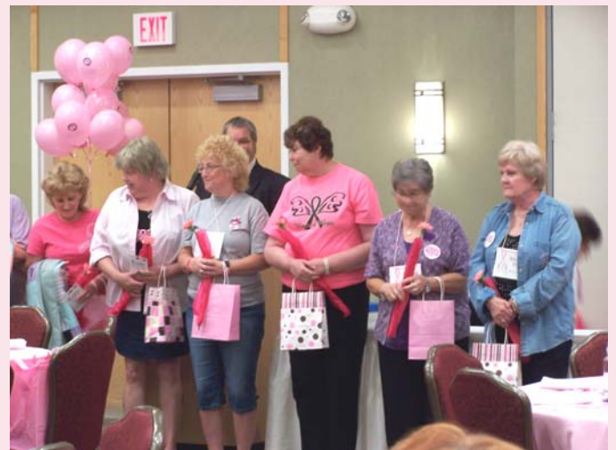
Breast cancer survivors honored at the Breast Cancer Awareness Walk in Harrison County