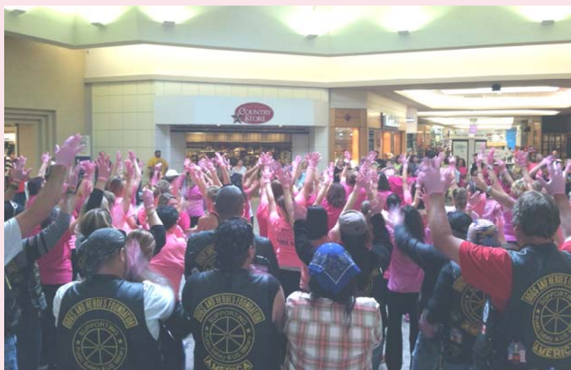
Pink Glove Dance at Meadowbrook Mall