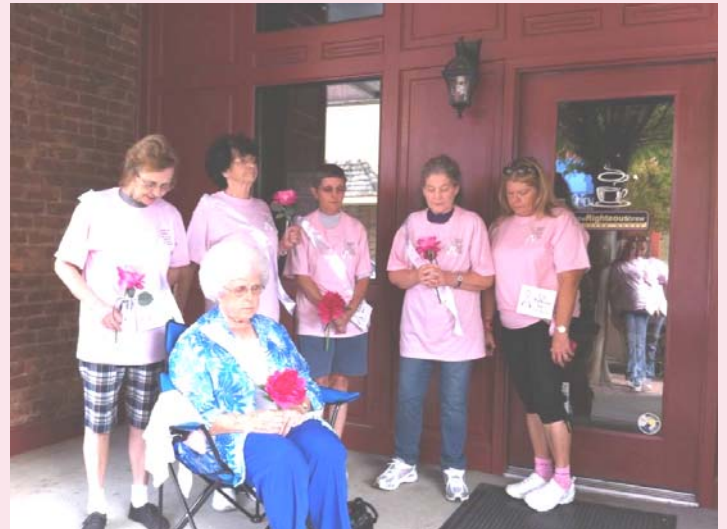
Survivors in prayer in Williamson