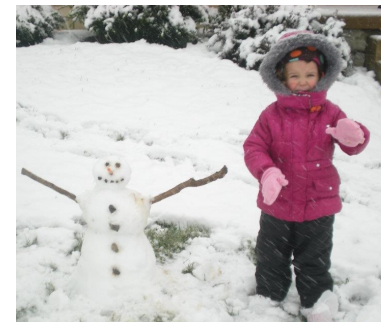
"Do you wanna build a snowman?"